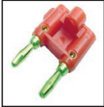
30-440 Red 30-441 Black Dual banana plug, gold plated. .24" cable opening. 0.75" centers.

Technical drawings and specifications are available for these connectors. Please ask your Calrad sales representative for details.