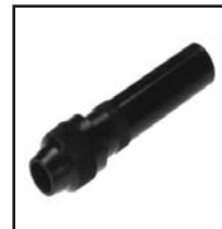
30-383 Motorola type antenna in-line twist on jack, no soldering. .3" cable opening.