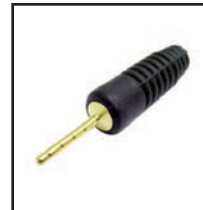
30-610-RB 1 Red, 1 Black 30-610-RBBK 2 Black 30-610-RBRD 2 Red Rubber Speaker pin plug, gold plated with P.V.C. cover, crimp style.