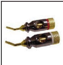
30-609-RD Red 30-609-WH White Speaker terminals with solder/solderless speaker pin. White or red color band. Accepts 8-18 awg. cable. Gold plated with black chrome finish.