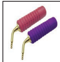
30-614-BK Black 30-614-RD Red Solderless Gold Speaker Pins Notched pin design prevents accidental push pin removal. Slotted or hex set screw. Accepts 10-18 Awg. Cable.