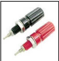
90-799 Black 90-800 Red 5-way binding posts. Plastic insulation. Has .1875" keyed threaded mounting shaft. Mounts in panels up to .25" thick.