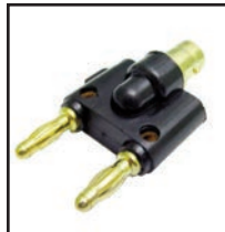
30-438 BNC Female to dual standard banana plugs. 0.75" centers.