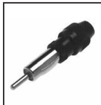
30-382 In-line solderless Motorola type plug. .26" cable opening.