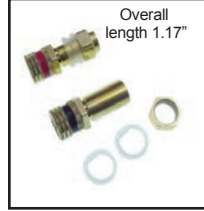
30-601 1 Red, 1 Black 30-601-BK 1 Black 30-601-RD 1 Red Banana/Binding Post Solderless speaker termination on each end. Accepts banana style connectors or raw speaker cable up to 14AWG. Mounts in 3/8" hole.