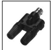
30-461 BNC Female to dual binding posts for wire or standard banana plugs. 0.75" centers.