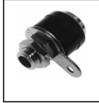
30-444 Black 30-445 Red Insulated banana jack. Supplied with soldering lug and nuts.