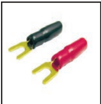
30-613-BK Black 30-613-RD Red 30-613 Red&Black Spade terminal, gold plated crimp on connector, with P.V.C. cover, black or red. .15" to .3" cable opening.