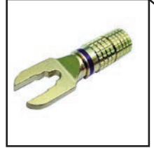
30-615-BK Black 30-615-RD Red Spade terminal, heavy duty gold plated, screw type adjustment with black or red band. .25" cable opening.