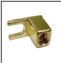
30-612 Gold Speaker Terminals with hex set-screw. Pack of 4 with Hex wrench. Accepts up to 10 Awg cable.