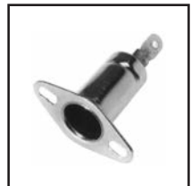
30-380 Chassis mount antenna jack. Female receptacle. .4" hole size.