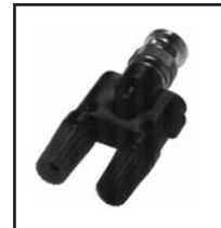
30-439 BNC Male to dual binding posts for wire or standard banana plugs. 0.75" centers.