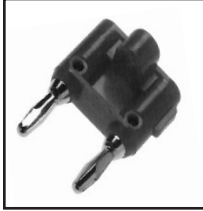
30-440-NK Red 30-441-NK Black Dual banana plug, nickel plated. .24" cable opening. 0.75" centers.