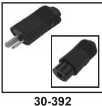
30-392 2-pin inline Male speaker plug. .23" x .11" cable opening. 30-393 2-pin inline Female speaker plug. .26" x .17" cable opening.