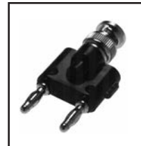
30-460 BNC Male to dual standard banana plugs. 0.75" centers.