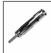
30-381 Antenna-type plug. To fit Calrad 30-380.