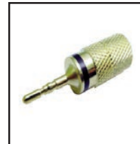
30-606-BK Black 30-606-RD Red Solderless speaker pin plug. Accepts up to 8 awg wire. Gold plated with red or black ID band options.