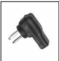
30-369 Right angle, 2-pin Male speaker plug. .23" x .13" cable opening.