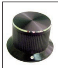
85-580 Black 1" diameter control knob \frac{9}{16} " high with set screw. .62" high.