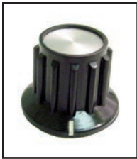
85-561 Black, bakelite knob with chrome insert, fluted grip. \frac{1}{4} -inch brass bushing with set screw. \frac{3}{4} " Diameter, \frac{9}{16} " high.