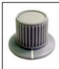
85-663 Grey Same specs as 85-660, except without numbers.