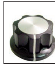
85-560 Black, bakelite knob. Fluted grip, \frac{1}{4} -inch brass bushing with set screw. \frac{3}{4} " Diameter, \frac{7}{16} " high.