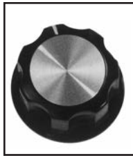
85-574 Black bakelite, aluminum insert. Fluted grip, \frac{1}{4} -inch brass bushing with set screw. 1\frac{5}{16} " Diameter, \frac{5}{8} " high.