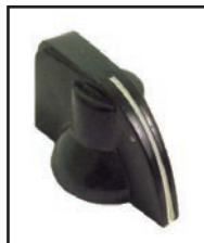
85-559 1\frac{1}{4} -inch, black pointer knob. \frac{1}{4} -inch brass bushing with set screw. .60" high.