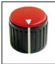
Black base with color caps available in 5 different colors. \frac{1}{4} " I.D. brass bushing. \frac{3}{4} " DIAMETER \frac{5}{8} " HIGH 85-595 .....Red 85-596 .....Grey 85-597 .....Yellow 85-598 .....Green 85-599 .....Blue