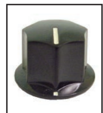
85-571 Black bakelite knob. Fluted grip, \frac{1}{4} -inch brass bushing with set screw. \frac{15}{16} " Diameter, \frac{9}{16} " high.