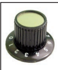
85-660 Black Easy grip, knurled control knob. White number 0-10 imprinted on skirt. \frac{1}{4} -inch brass bushing. \frac{7}{8} " high, 1\frac{7}{16} " diameter.