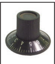
85-575 Calibrated 0-10, chrome numbers on skirt. Size 1\frac{3}{16} " x \frac{3}{4} " with \frac{1}{4} " brass bushing. .75" high.