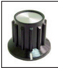
85-572 Black bakelite with aluminum insert, fluted grip. \frac{1}{4} -inch brass bushing with set screw. 1" Diameter, \frac{3}{4} " high.