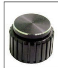
Serrated grip with attractive chrome edge, \frac{1}{4} -inch brass bushing with set screw.