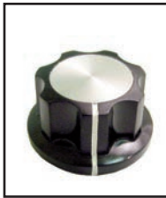
85-569 Black bakelite, aluminum insert. Fluted grip, \frac{1}{4} -inch brass bushing with set screw. 1" Diameter, \frac{1}{2} " high.