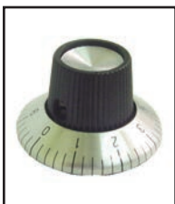
85-567 Chrome-skirted instrument knob. Calibrated 0-9. Fluted ebony grip with aluminum insert for \frac{1}{4} -inch shaft with set screw. (Diameter \frac{3}{16} ") .68" high.