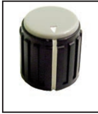
Black base with color caps available in 5 different colors. \frac{1}{4} " I.D. brass bushing. \frac{9}{16} " DIAMETER \frac{9}{16} " HIGH 85-590 .....Red 85-591 .....Grey 85-592 .....Yellow 85-593 .....Green 85-594 .....Blue