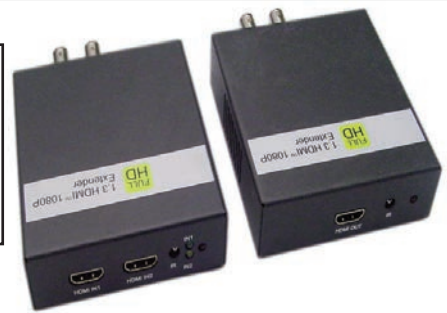
HDMI Over a Single Coax Cable