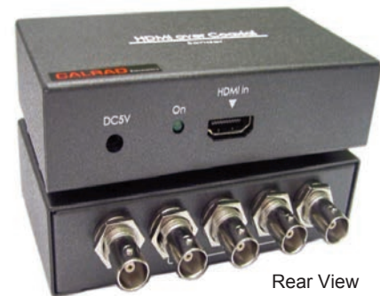
HDMI Over Five Coax Cables