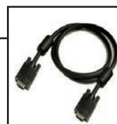
VGA Video Cable