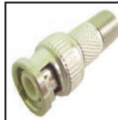
75-679 "F" Female to BNC Male adapter.