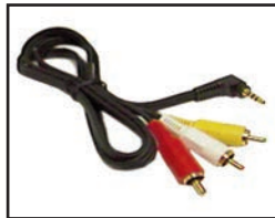
3.5mm 4 conductor plug