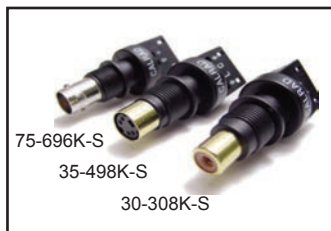
75-696K-S 35-498K-S 30-308K-S