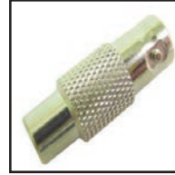
75-629 BNC Female to a RCA Female.