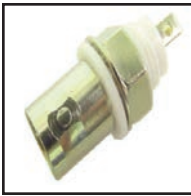
75-514 BNC Female, isolated ground from chassis. Length is 1.06". Mounts in .37" chassis hole. Bushing length .38".