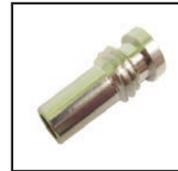
30-473 for RG58U. 30-474 for RG59U. Coax cable adaptor Both for use with 30-465.