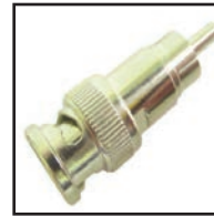
75-563 RCA Male to BNC Male. Over all length is 1.55".