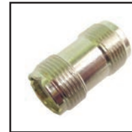
30-472 UHF double Female connector.