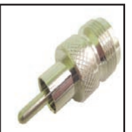
30-469 UHF universal jack adaptor. Adapts SO-239 to Motorola-type auto antenna jack or RCA-type phone jack.