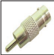
75-548 BNC Female to RCA Male. 75-548G Gold version 75-548-S Nickel body, Gold pin 75-695 75 ohm version.