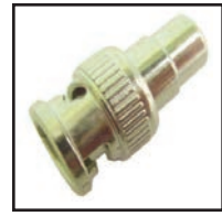
75-547 BNC Male to RCA Female. 75-547G Gold version.