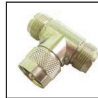
30-471 UHF "T" connector adapts 2 Females to one Male.