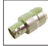
75-564 SO-239 Female to BNC Female.