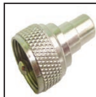
75-557 RCA Female to UHF Male.