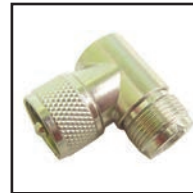
30-470 UHF right angle adapter SO-239 to PL-259.