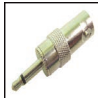
75-553 3.5 mm mini phone plug to a BNC-type Female connector.