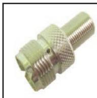
75-524 UHF Female to "F" Female.