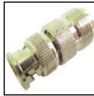
75-544 UHF Female to BNC Male.