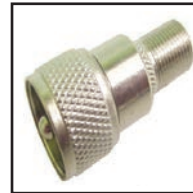
75-516 F-81 type Female to PL-259 type Male adapter. 75-516G Gold version.