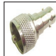
75-545 UHF Male to BNC Female.