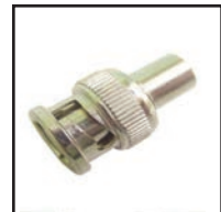
BNC TERMINATORS 75-600 - 50 ohm/5% 75-601 - 75 ohm/5% 75-602 - 93 ohm/5% 75-600-1 - 50 ohm/1% 75-601-1 - 75 ohm/1% 75-602-1 - 93 ohm/1%