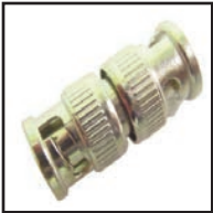
75-562 BNC Male to BNC Male adapter. Overall length: 1.25".