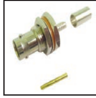
75-685 BNC Female chassis mount jack for RG-174U cable. 75 ohm. Fits in a 1/2" "D" hole. Bushing length .33"