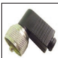
75-558 Right angle UHF Male connector for coax cable.