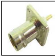
75-515 BNC Female, chassis-mount. Length is 1.08".