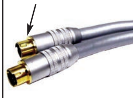
Metal Connectors with Gold Contacts & Silver Finish