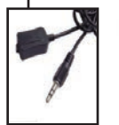
IR Ext. Receiver Included