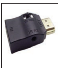
HDMI IR Dongle