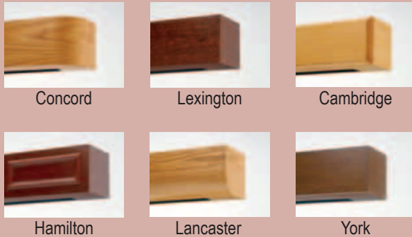
Six case designs to blend with any room decor.