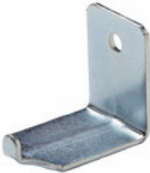
Pt. # 700247