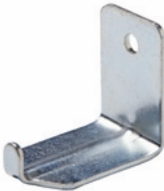
Pt. # 700249