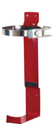
Pt. # 700260