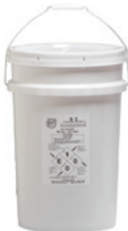
Standard (BC) Pt. # 61400