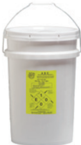
ABC Pt. # 61000