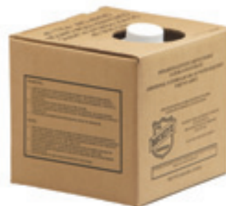
6 Liter Container Pt. # 600872