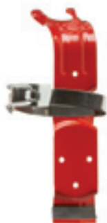
Pt. # 700287

Whether you are looking for vehicle or marine vessel mounting, or simply to mount on a wall, you can be sure that all our brackets and wall hooks are designed to keep your Buckeye fire extinguisher secure and readily accessible.