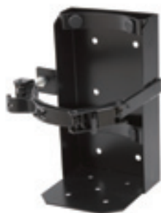
Pt. # 700224