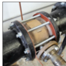
Foam Concentrate Proportioners