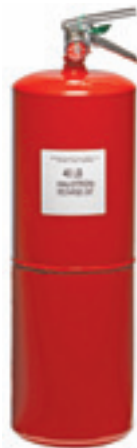
40 lb. - Pt. # 64040 150 lb. - Pt. # 64150 200 lb. - Pt. # 64200