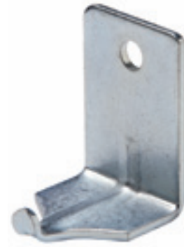
Pt. # 700204