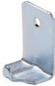
Pt. # 700203