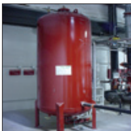
Foam Bladder Tanks