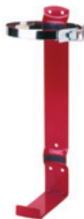
Pt. # 700430