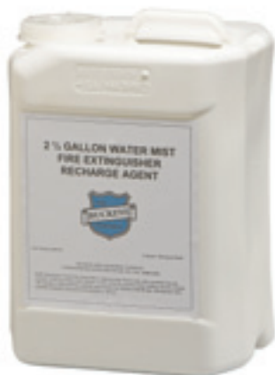
2.5 Gallon Container Pt. # 600910