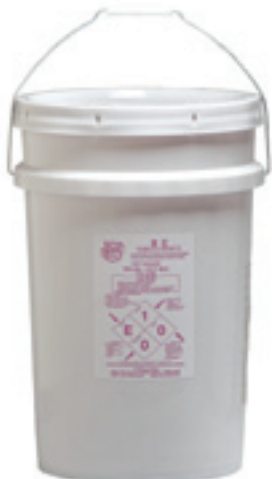
Purple K Pt. # 61200