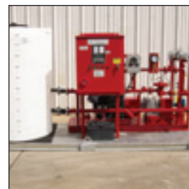
Diesel Pump Skids