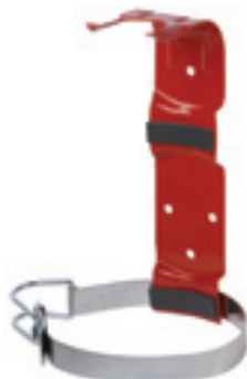
Pt. # 700270