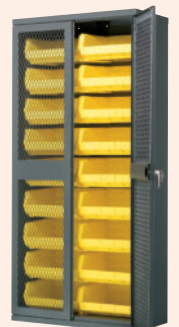
Secure-View Security Cabinet