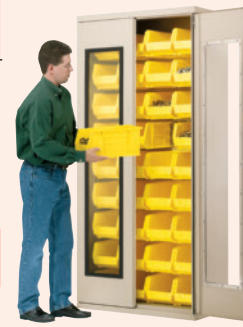
Quick-View Security Cabinet