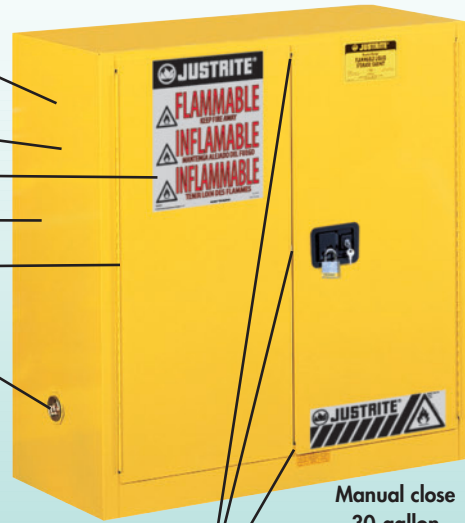
Manual close 30-gallon

Fusible links hold doors wide open and melt at 165° F for automatic closure