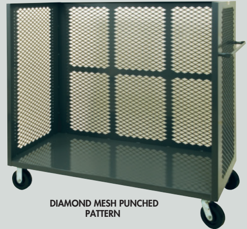
DIAMOND MESH PUNCHED PATTERN