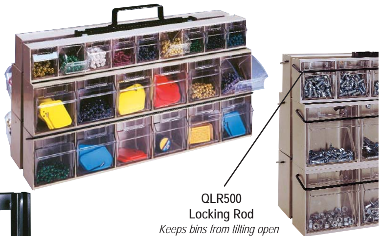
QTF320-42 Complete Unit