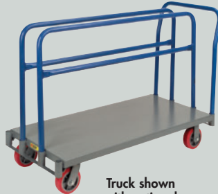
Truck shown with optional pushbar handle.