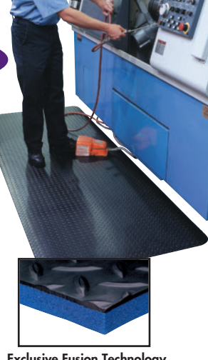
Exclusive Fusion Technology

Perfect for machine shops, shipping and packing areas, factories, counters and cashiers. Resistant to most common chemicals. Beveled edges on all sides. Available in Black Deck Plate (BK), Gray Deck Plate (GY) or Black w/Yellow Border (YB) -- please specify. 3 year guarantee against delamination. FOB Shipping Point.