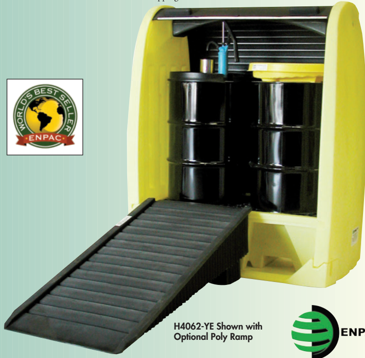
H4062-YE Shown with Optional Poly Ramp