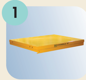
Platform Size (HT2448)