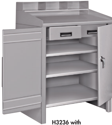
H3236 with HP-36 shown

Custom Design... All items can be modified to suit your needs. Call for information.