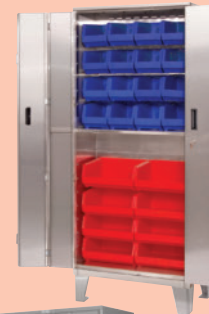
HBDSC-SS-3678-18-B Shown with Optional 6"H Legs Stainless Steel