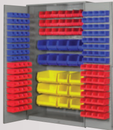
Style A Bin Storage Cabinet Includes bin boxes on inside of cabinet and in door of cabinet.

Heavy duty cabinets feature flush doors for handsome good looks. Ideal for factory or office use. Swing doors equipped with 3 point locking mechanism for extra security. Includes locking chrome handle. FOB Shipping Point.