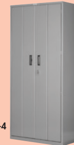
HBDSC-3678-18-4 Powder Coat