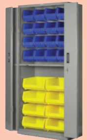
HBDSC-3678-18-B Powder Coat