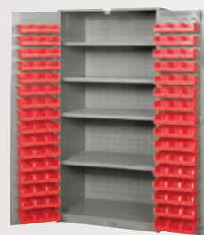
Style B Bin Storage Cabinet Bins on both doors, 4 adjustable shelves within.