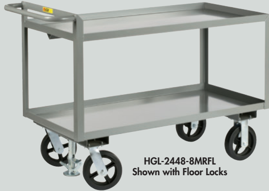
HGL-2448-8MRFL Shown with Floor Locks

Completely welded to form a solid unit, this 12 ga. steel cart stands up to hard punishment. Mold-on rubber wheels are quiet and tough. 2400 lb. cap. model is available with floor lock to hold cart in place when at rest. FOB Shipping Point.