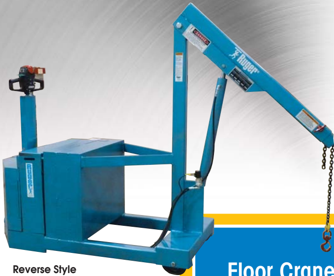
Reverse Style Full Power