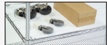
Plastic Shelf Inlay