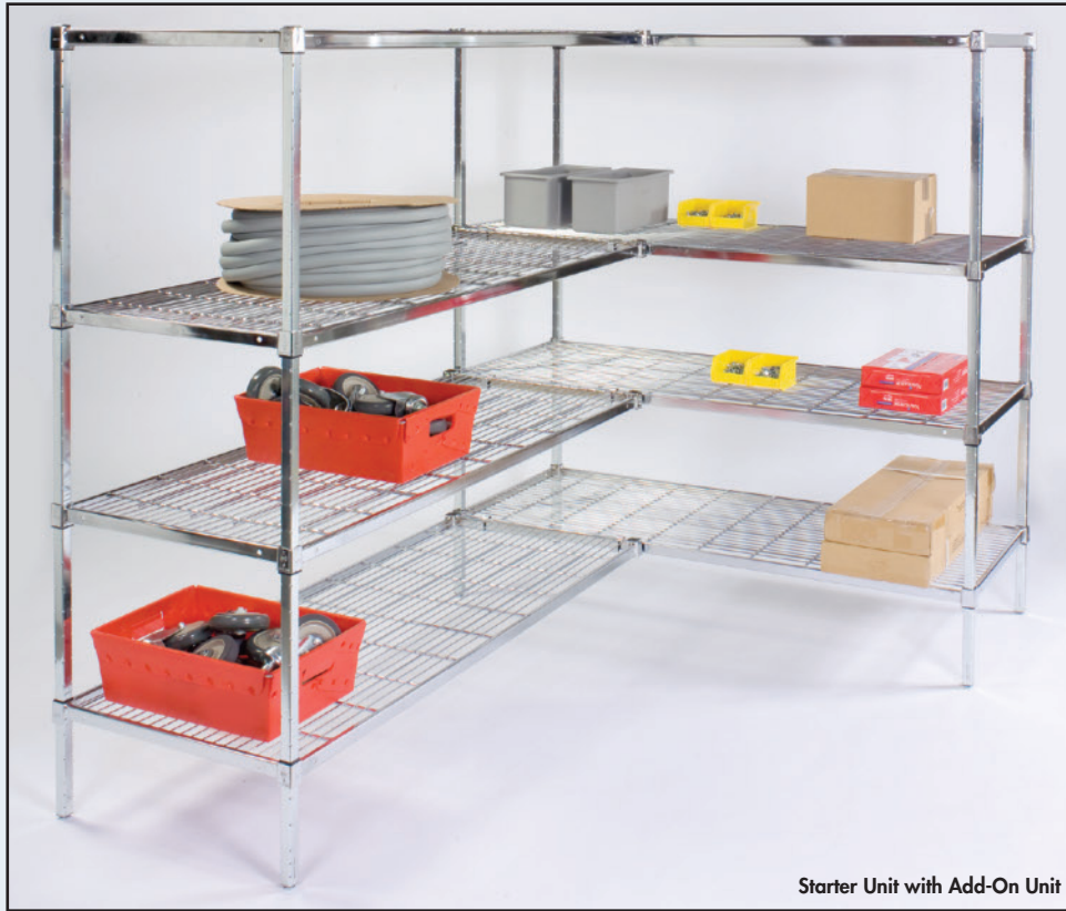
Starter Unit with Add-On Unit