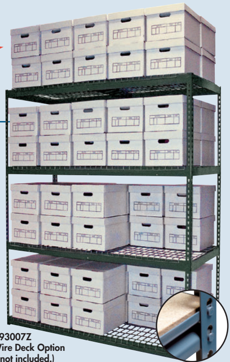
HRAS693007Z With Wire Deck Option (Boxes not included.)

Rugged boltless construction provides for a cost efficient storage system. Rigid connections provide solid support for decking. 69" wide shelves with particle board will support 1,000 lbs. 42" wide shelves with particle board will support 600 lbs. based on UDL. Please call for weight capacities when using wire deck. Shelves adjust on 1/2" centers. Super strong posts are one piece construction. Available with solid particle board or 50% open wire decks. Price includes new Zee Beams. Made in USA. FOB Shipping Point.