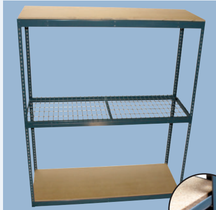
Basic Three Shelf Unit - 7' Tall Framework, PB or Wire Decking