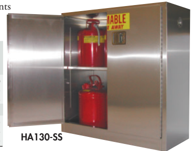
Images may show content not included with purchase of cabinet.