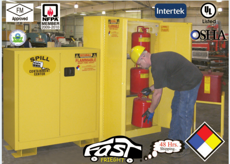
Images may show content not included with purchase of cabinet.

Keep flammable liquids close to the work area in a safe and organized way. Features 18 ga. all welded steel with double wall construction. Flush mounted locking handle and 3-point self-latching doors provide extra safety. Galvanized steel shelving is adjustable on 5" increments. All cabinets comply with current OSHA regulations and are designed in accordance with the standards of NFPA Code 30. All models are FM approved. FOB Shipping Point.