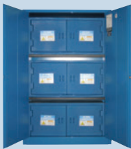
HC145 Shown w/ HPE3045

Keep most acids safe and at hand with Acid & Corrosive Cabinets for both flammable and nonflammable corrosives. Complies with NFPA and current OSHA requirements. Cabinet has a 3/8" leak-proof tray top, which can completely contain a 5 pint spill. Cabinets finished in Blue corrosive-resistant urethane. Adjustable painted galvanized steel shelves with removable polyethylene trays. FOB Shipping Point.