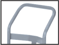
Flow Back (FB)

Easy handling truck for industrial-duty use. All welded construction is shipped ready to work. 13 gauge welded pipe frame with concave cross straps and a straight vertical strap strengthens frame. Standard 7" x 14" steel nose plate. Heavy flat bar and tube for climbing stairs or curbs. Two position bracket fits 8" or 10" wheels. Flow Back and Dual Loop handle options. Deep-V cross straps available for specialized loads -- please contact dealer. FOB Shipping Point.