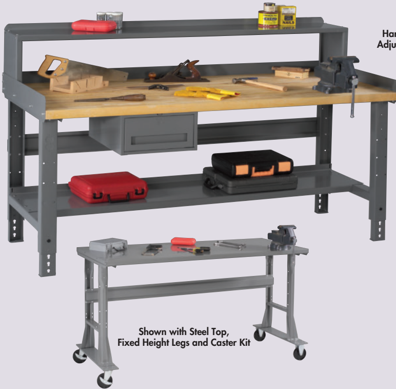
Shown with Hardwood Top and Adjustable Height Legs