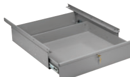
25" Wide Locking Drawer