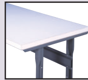
Plastic Laminate Top