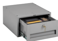
15" Wide Locking Drawer