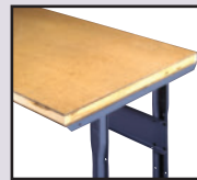
Compressed Wood Top