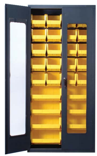
QSC-C240250 Clear-View Security Bin Cabinet

36 QUS220, 18 QUS230 and 4 QUS240. See page 3 for bin dimensions.