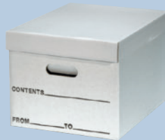
EZ Folding File Storage Boxes