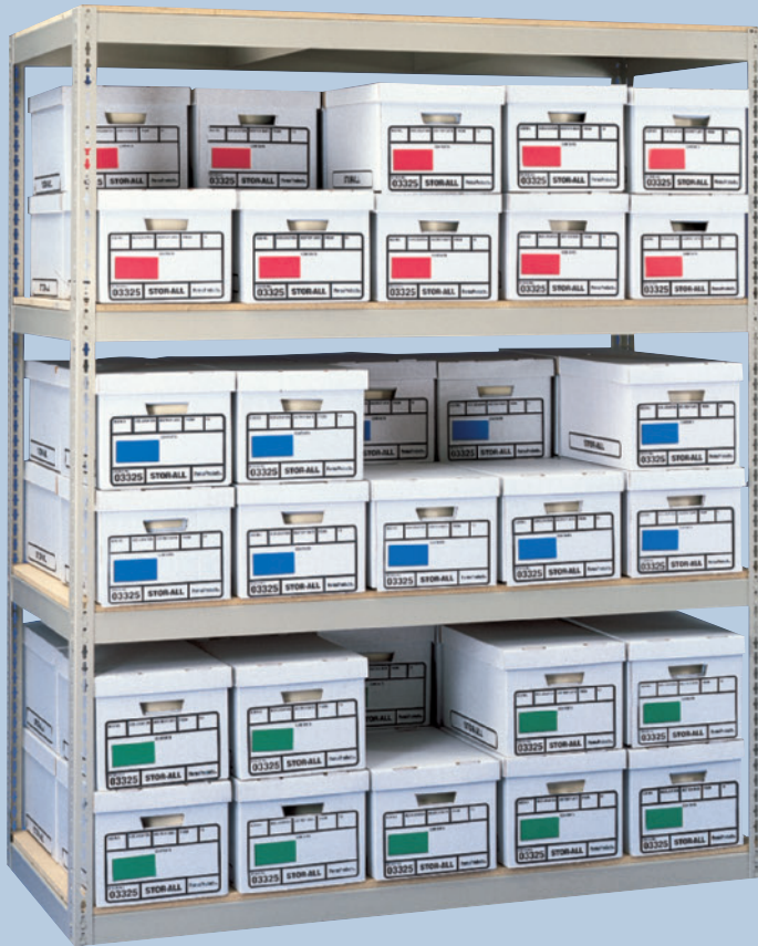
Record Archive Shelving w/ParticleBoard Decking HZA691584-4D