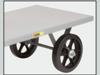
Flush Metal Deck