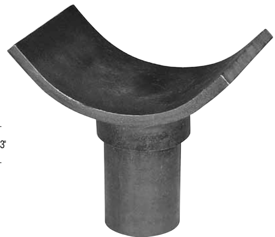
Fig. 258 Fabricated Steel

Square Cut End for use with Figure 258 or 259 Pipe Saddle Support