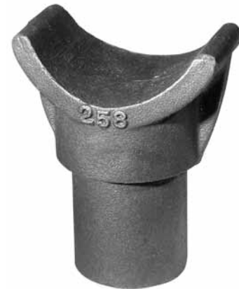
Fig. 258 Cast

Order Separately: Figure 63P Square Cut End Stanchion. Specify "H" and pipe size to be supported by Figure 258.