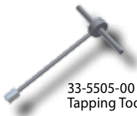
33-5505-00 & 33-5505-01 ~ Combination Tapping Tool & Saddle Bolt "T" Wrench