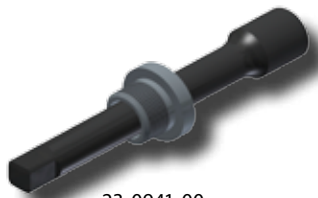
23-0941-00 Hex Drive Key, Bushing and Socket Adapter for 1416 Style Tees (pg 31)