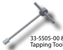
33-5505-00 & 33-5505-01~ Combination Tapping Tool & Saddle Bolt "T" Wench