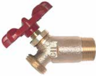
31-600 Male NPT