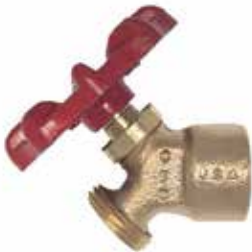
31-700 Female NPT