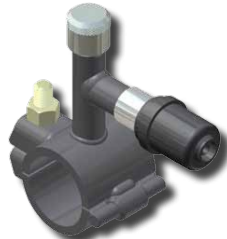
23-3691-00 & 23-3692-00 Hex Drive Key, Bushing and Socket Adapter for 1214 & 1315 Style Tees (pg 31)