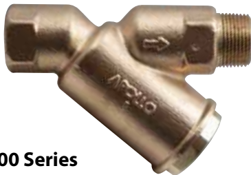
59-400 Series F x MNPT

Large volume design for excellent protection against foreign particles in your fluid system. Corrosion-resistant bronze body and stainless steel screens provide years of service.