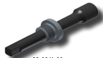
23-0941-00 Hex Drive Key, Bushing and Socket Adapter for 1416 Style Tees (pg 31)