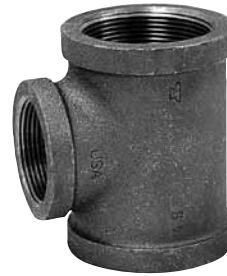
FIGURE 1105R Reducing Tee (Cont'd.)