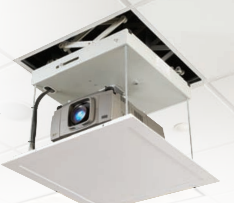
MPL installation featuring optional ceiling closure at DePauw University's Green Center for the Performing Arts, Greencastle, IN.

\textit{Kevlar}^{\texttt{@}} \textit{ is a registered trademark of DuPont.}