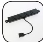
4-Outlet Power Strip