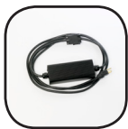
Power In-Feed Cable