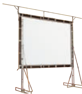
At left: Black velour Dress Kit attached to a Truss Cinefold. Above: Rear view of Truss Cinefold with Valance Bar and Drapery Side Bars.