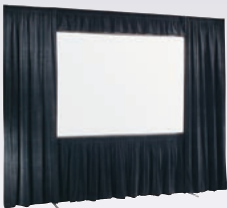
The valance bar attaches to the top of the Ultimate Folding Screen frame. Two drapery side bars slide easily into each end of the valance bar and lock with a ball detent.

GIVES A PROFESSIONAL APPEARANCE TO UFS, CINEFOLD, AND TRUSS-STYLE CINEFOLD