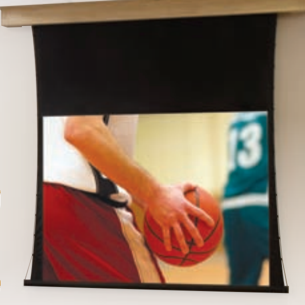
Lake Anna YMCA, Barberton, OH.