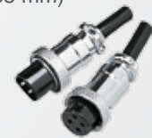
CD4BAR - 25FT