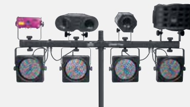
Additional power outlets and mounting points. Stand optional for additional fixtures.