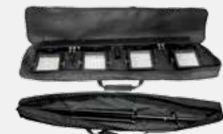
Tripod, Footswitch, Carry Bags included