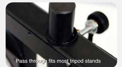
Pass through fits most tripod stands