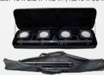
Tripod, Footswitch, Carry Bags included