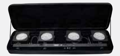
Footswitch and Carry Bag included