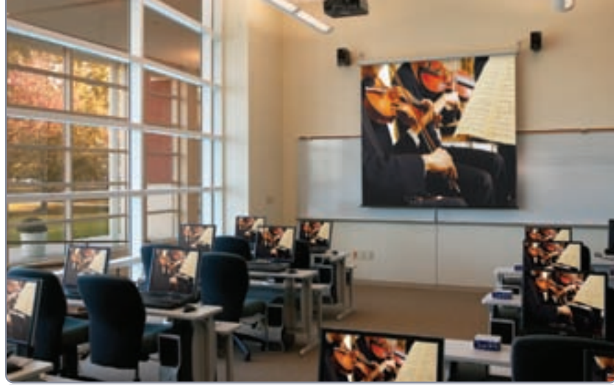
DePauw University, Greencastle, IN.