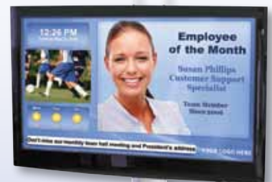
Flat panel not included

BSG-57 $72.50 Camera Stand for Buhl SFP-55 • Dimensions: 12" x 14" • 2 lbs.