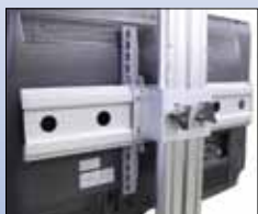
Supports TVs up to 55"

A durable and stylish way to securely hold a flat panel display and the equipment you use with it