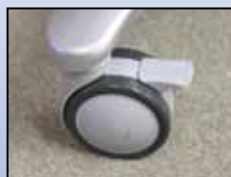
Large 4" locking casters