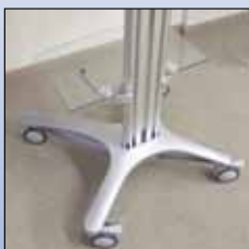
4 rubberized wheels for smooth and stable rolling