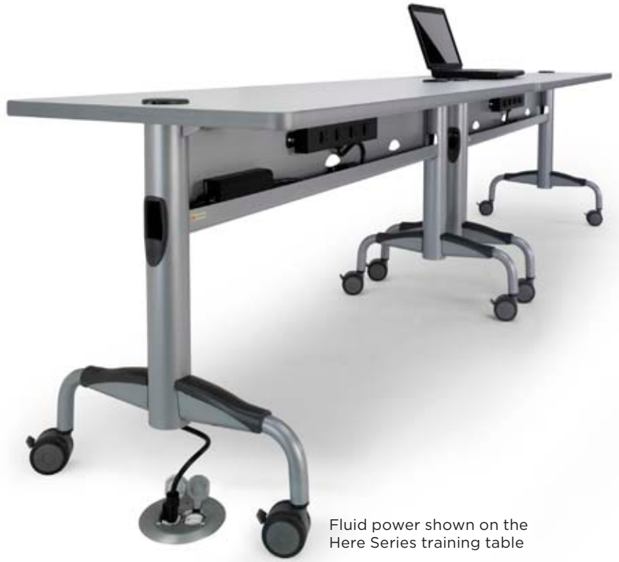
Fluid power shown on the Here Series training table