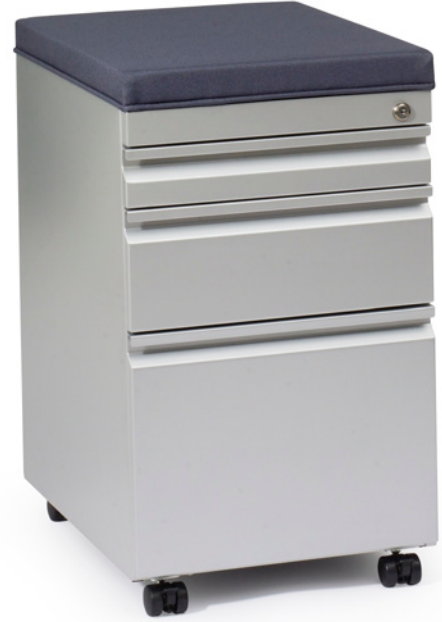
Shown with optional seat cushion