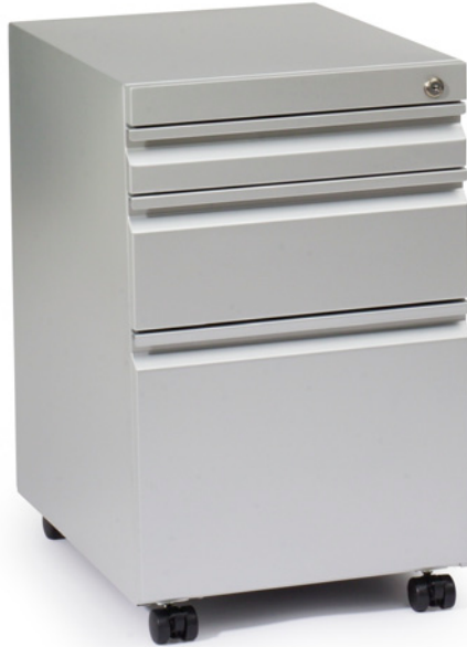
Mobile Storage Pedestal in Aluminum