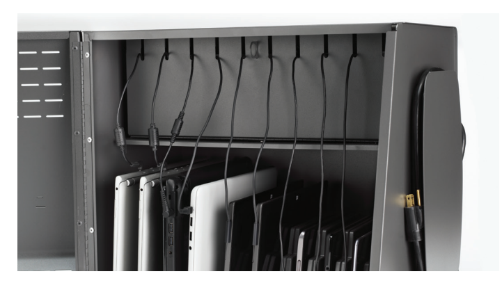
Stores and charges mixed devices - or all the same