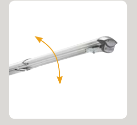
PRECISION HEIGHT & LEVELING

Fully internal cable management system conceals and protects cables for a clean finish.