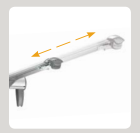
VARIABLE EXTENSION OPTIONS